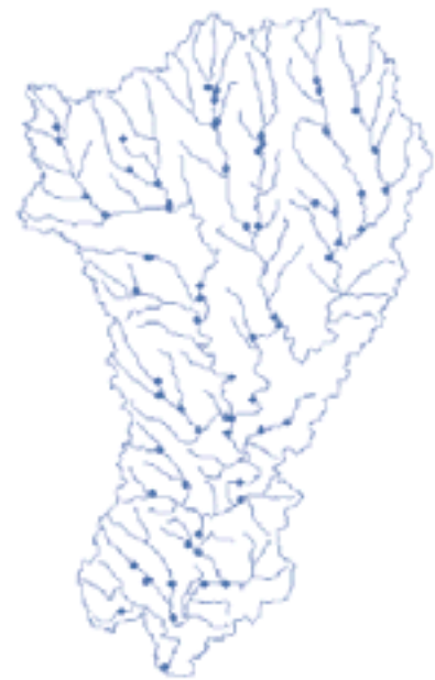
Locations of environmental monitoring stations within the Sunday Creek Watershed.

Now that the total allowable load of pollutants has been determined, the goal is to work towards lowering these contaminant limits back to a level where streams are fishable and swimmable again, and to where the streams can support a healthy diversity and abundance of fish and macroinvertebrate species.