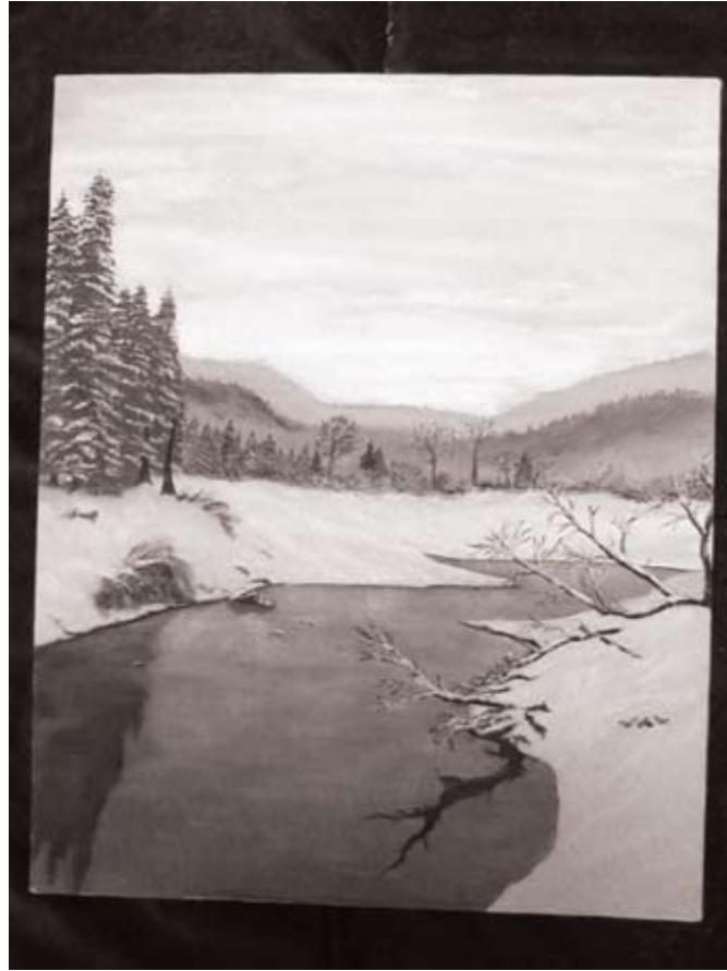
Landscape By Tim Lemoine of Glouster, OH (See it in full color at www.sundaycreek.org/art )

Non-Profit Org. U.S. Postage PAID Athens, Ohio Permit #159