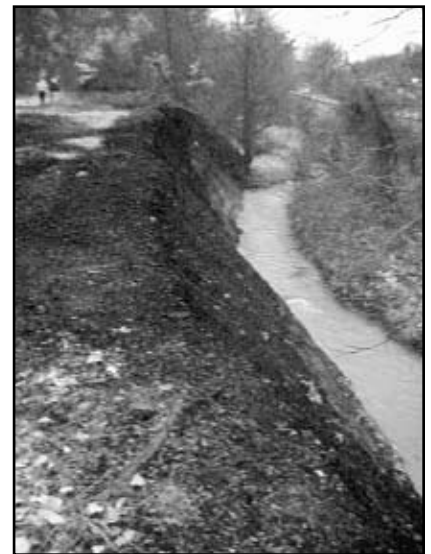
Representatives from ODNR examine a large gob pile along the banks of the West Branch Headwaters. Under the current project this area will be reclaimed.