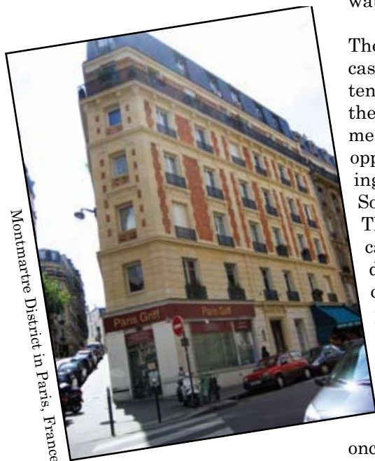
Montmartre District in Paris, France