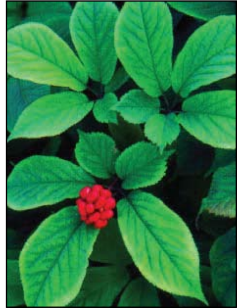
Ginseng.

Sustainable Forestry has been fostering partnerships during the past six months. In November, it was announced that they would be working with our good friends at the Mountain Association for Community Economic Development (MACED) and Appalachian Sustainable Development (ASD) under a multi-million dollar grant from the U.S. Forest Endowment. The grant will support Rural Action's partnership with MACED to bring a carbon-trading program to managed forests in Appalachian Ohio. The National Network of Forest Practitioners (NNFP) has also been working with Forestry in an economic review of non-timber forest products, like ginseng and goldenseal. The forestry program is currently helping the newly christened Ohio Forestry Cooperative (OFC) to expand their business capacity in our region. In conjunction with our Sustainable Agriculture program, Forestry sold 60 pounds of ginseng and 12 pounds of goldenseal to help local growers this year. In the same vein, they partnered with the Wayne National Forest this fall to collect and clean seeds