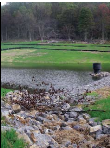
Belden Project

Huff Run Watershed Restoration Partnership (HRWRP) has been forging new connections and partnerships in the Mineral City community, as well as continuing their watershed renewal work. HRWRP's Environmental Explorers Club continues to engage children with nature and the world around them, meeting once a month at the Nicole Donant Library in Mineral City. In August, HRWRP hosted their fifth annual Huff Run 5K at Mineral City's Party in the Park, raising money and awareness with 30 runners participating. HRWRP also worked with OEPA this summer