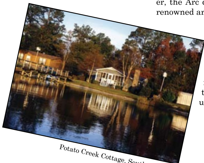
Potato Creek Cottage, South Carolina

In addition to these travel packages, regional businesses and community members have donated quality merchandise and gift certificates to create other unique packages.