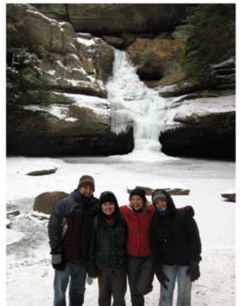
Rural Action volunteers in action!